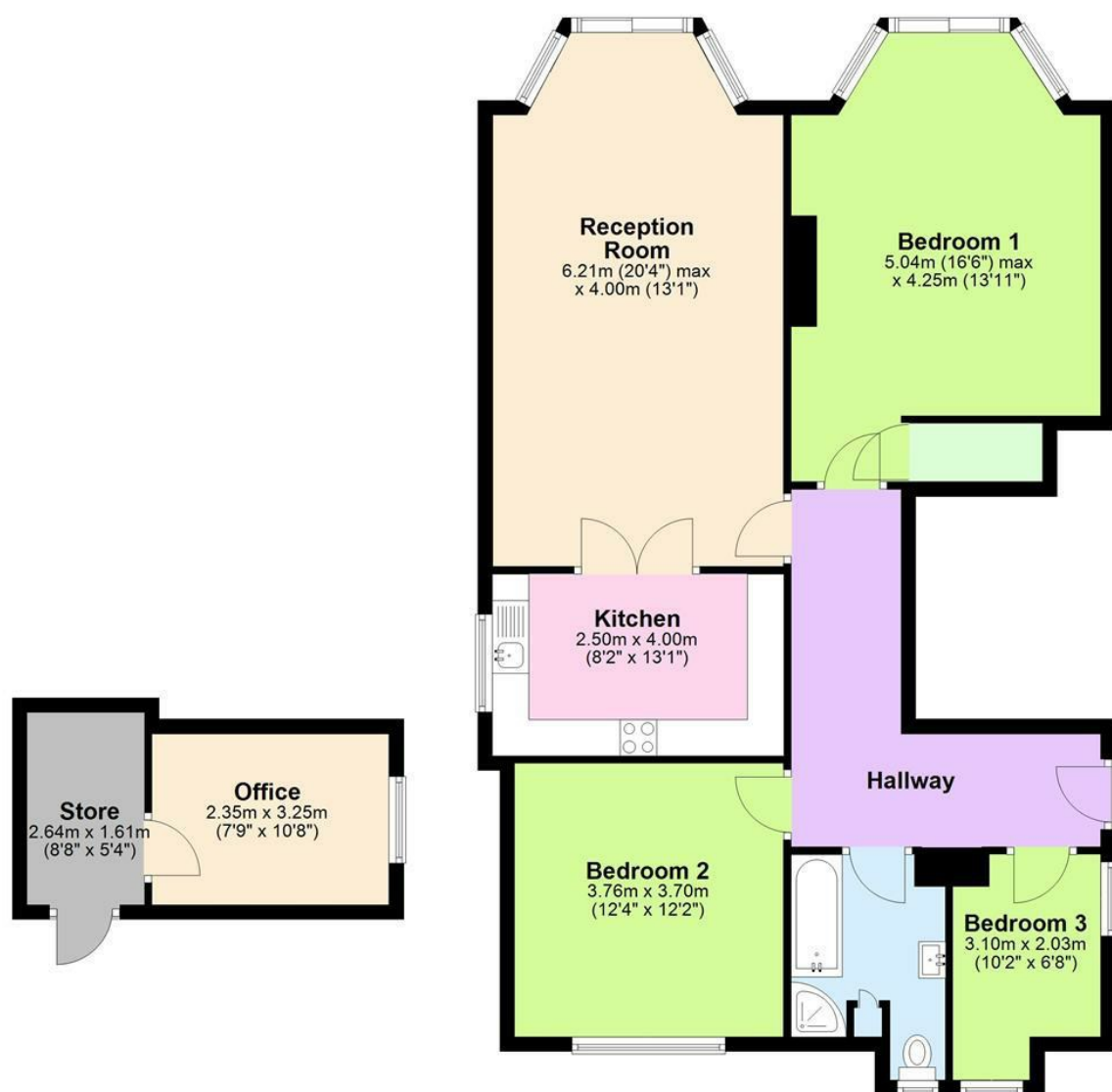
Ground Floor Approx. 112.9 sq. metres (1215.4 sq. feet)

Total area: approx. 112.9 sq. metres (1215.4 sq. feet)