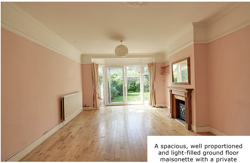
A spacious, well proportioned and light-filled ground floor maisonette with a private rear garden situated within easy walking distance of Kings Langley High Street.